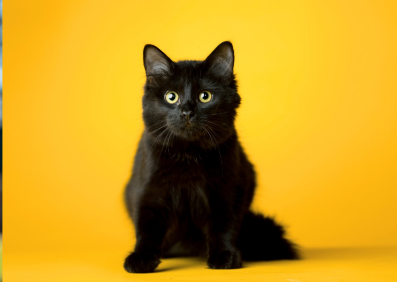
Jaguar, adopted November 2020